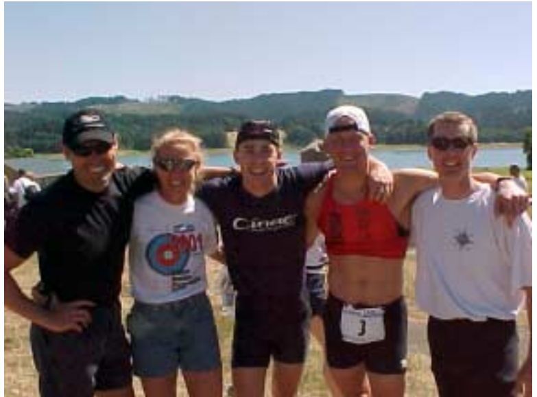
Some members of the Performance Multisport Club

Blues City Racing California State Long Beach Triathlon Club Central Arkansas Triathlon Society Central Florida Triathletes Cherry Creek Athletic Club Triathlon Club Cleveland Triathlon Club Forward Motion Racing Heart City Tri Club Lawrence Multi-Sport Meridian Athletic Association Phoenix Triathlon Club Red River Triathlon Club, Inc Richmond Triathlon Club Run-N-Fun Traithlon Team St. Pete Mad Dogs Strokes and Strides Triathlon Team Team Magic, Inc Team Xtreme Terrapin Racing Tri KC Truman State University Triathlon and Running Club Tupelo Triathlon Club Twin Cities Triathlon Club